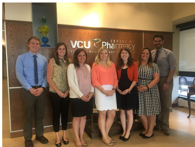
PGY-1 Residents at VCU School of Pharmacy participating in the Teaching Certificate Program