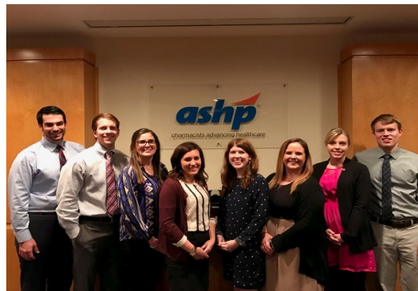
UVA residents at ASHP headquarters in Bethesda, Maryland

On November 1, 2016, all seven PGY1 residents as well as one PGY2 resident from UVA travelled to Bethesda, MD for a visit to ASHP headquarters. While there, residents had the opportunities to interact and network with residents from several other regional programs and learn more about ASHP's various offerings. They were able to choose from various sessions including accreditation update, and writing and reviewing for AJHP. Residents were introduced to various employees of ASHP. An open discussion was held over lunch regarding many "hot topics" within pharmacy. Some of these included provider status, resident research projects, and pharmacists role within the Emergency Department. The UVA residents were highly engaged in these discussions and provided insight into the pharmacy practice model at UVA hospital. The residents were able to put their training into perspective and discuss issues surrounding residency training with residents from various other programs in the country. The visit also provided a great opportunity to learn more about the role of a clinical pharmacist in the years to come.