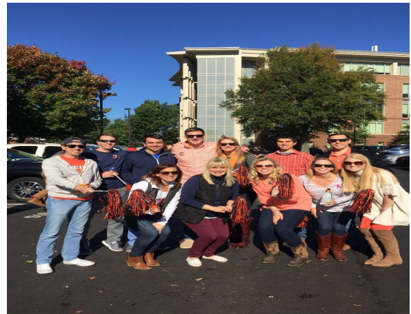
Residents enjoying a tailgate for UVA vs UNC football game