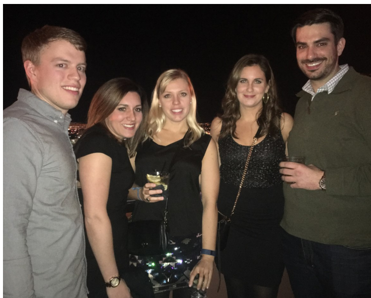
A few of the PGY-1 residents enjoying the view from the top of Mandalay Bay!