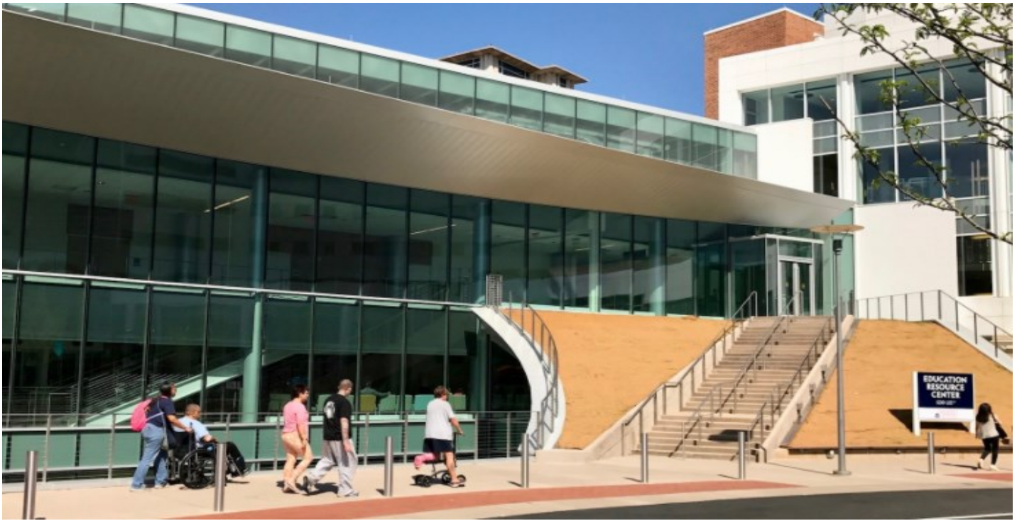
View of the new Education Resource Center located Directly across from the Main Hospital entrance.