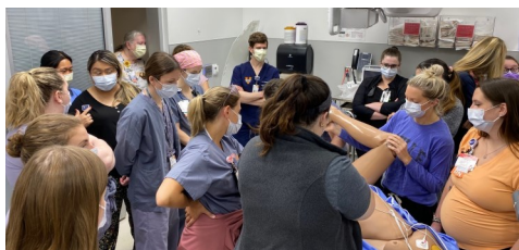
ED Peds simulation with L&D, OB/GYN, and NICU, June 2023