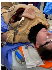
ED 500s simulation, August 2023, using a Cut Suit