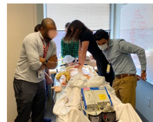
Adult Code Team Just-In-Time Training, Sept. 2023