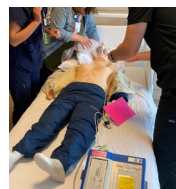
Acute Cards, Sept. 2023