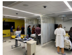
Family Medicine simulations, October 2023

We trust that these simulations are useful, and we thank those who trust us enough to be part of the simulations!