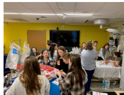
PICU RN Clin I simulations, October 2023