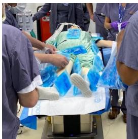
Orthopedic Center Ivy Road simulations, February 2023