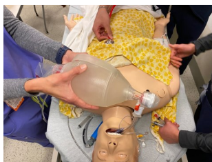
STICU Procedural Sedation simulations, November 2023