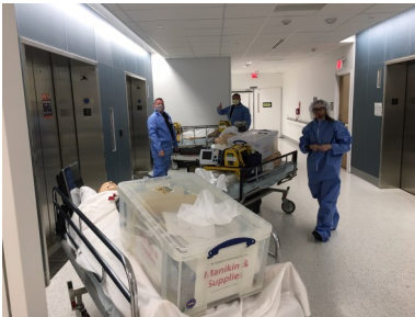
Going home after a four-manikin simulation in Interventional Radiology, July 2020

https://www.medicalcenter.virginia.edu/medical-emergency-simulation-area/simulation-newsletters