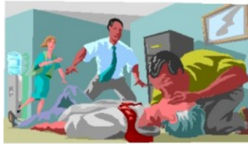
Heartsaver CPR AED Course Schedule

The Heartsaver course includes Adult/Child/infant CPR with how to use an AED, (automatic external defibrillator), and how to help a choking victim