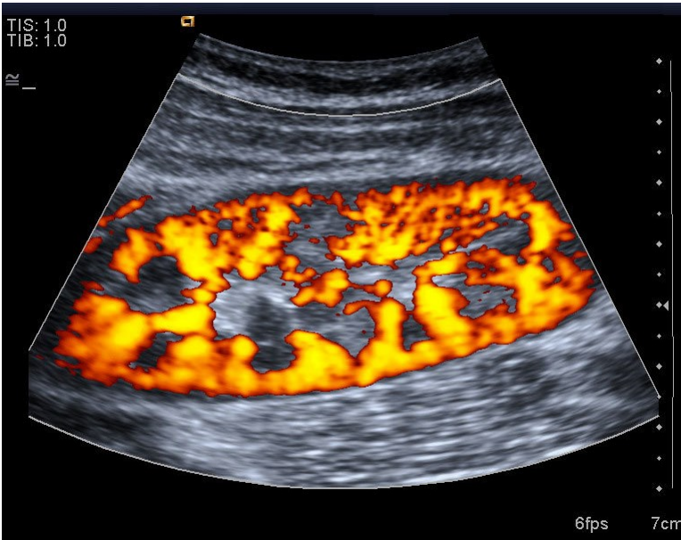
Ultrasound view of blood flow to kidneys.

An ultrasound study, or sonogram, is an exam that uses an instrument called a transducer to send safe high frequency sound waves into the body. The sound waves enter the body and bounce off the internal body structures and back to the transducer. The ultrasound machine gathers this information and transforms it into the ultrasound image.