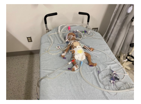
A PICU simulation baby with an intubation, a central line, a peripheral line, a UAC/UVC line, pacer wires, chest tubes, and various monitoring.

https://www.medicalcenter.virginia.edu/me sa/simulation-newsletters