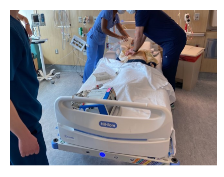
A First Five Minutes program on 5South.